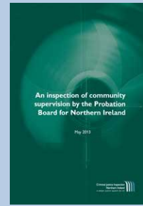
Community Supervision of Offenders Report